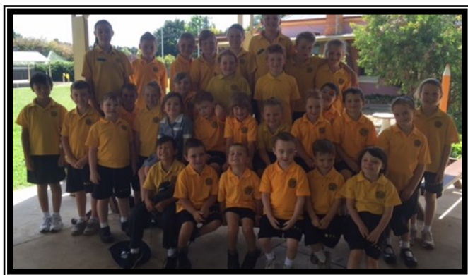
A Population Explosion at Wattle Flat!

The children have settled well into the new year and I am very proud of their attitude, effort and behaviour.