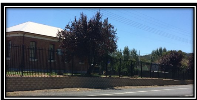
The School looks great!

For me this is an exciting year in our learning journey. Our School is a dynamic and vibrant learning environment with enthusiastic students and dedicated staff. New programs such as L3 - Language, Learning and Literacy , Fun with Friends and Friends for Life , and Computer Coding as well as established programs such as targeted literacy and mathematics, robotics and music continue to provide opportunities for students to engage in personalised learning.