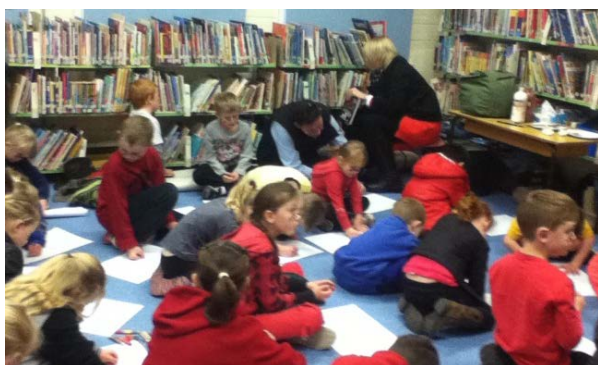
'Aboriginal for a Day' art and storytelling activities

What a busy time we have had already! The children have visited Sofala Public School to be 'Aboriginal for a Day'; entertained a group from Assisted Living at Tanwarra Lodge; formed a rock band and are preparing to perform at the Bathurst Small Schools Spectacular; embarked on an entrepreneurial challenge; learnt new skipping skills while they raised funds for Jump Rope for Heart; and are preparing their choir and verse speaking items for the Bathurst Eisteddfod. The capabilities of these children never ceases to amaze me. They are enthusiastic learners, with a great attitude and exemplary behaviour. We are extremely proud of them.