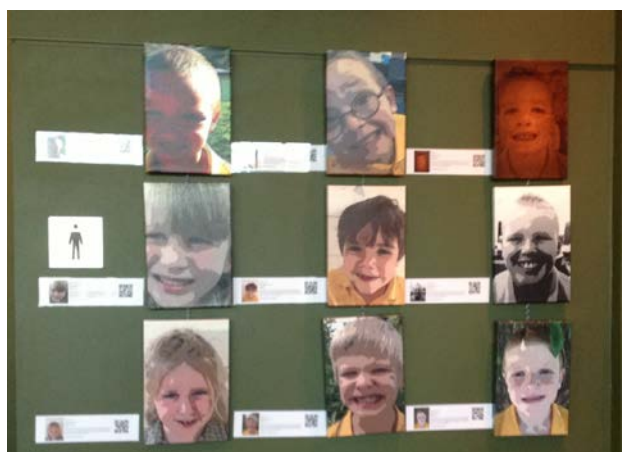
A section of Sofala School's display at BMEC