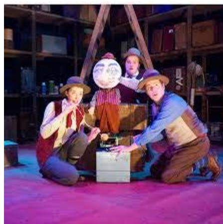
The cast of 'Mr McGee and the Biting Flea'

young and old! Thank you to parents for transporting the students to Bathurst - your time is greatly appreciated.