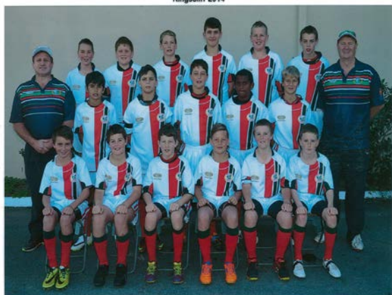
N.S.W. P.S.S.A. OPEN RUGBY LEAGUE STATE CHAMPIONSHIPS Kingscliff 2014