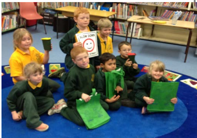
Our road safety talk