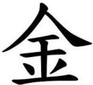
(Jin – The Chinese Character for Gold)

1856. This is the year that the first Chinese miners arrived in Sofala - about 150 men.